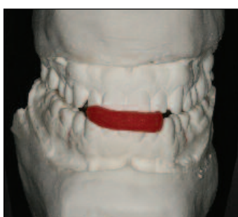
Figure 10. Pretreatment acrylic anterior centric relation jig preparation guide at desired new vertical dimension on mounted models.