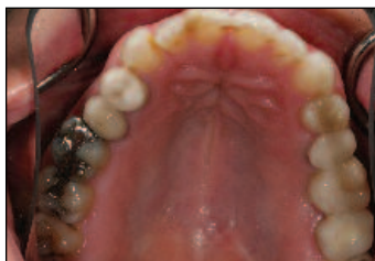
Figure 6. Maxillary occlusal view.