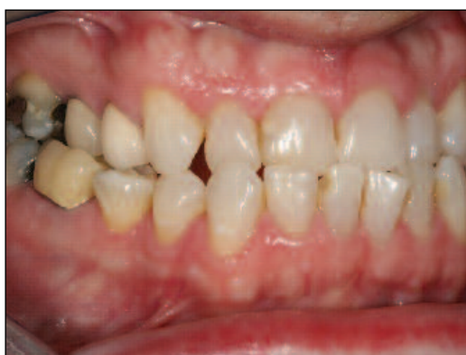
Figure 3. Retracted right lateral view in occlusion.