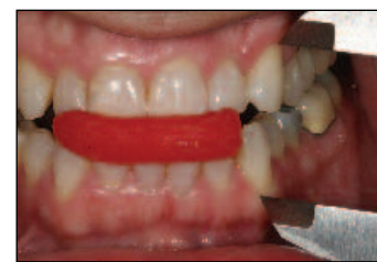
Figure 11. Anterior vertical dimension/centric relation jig. Digital caliper used to verify increase in vertical dimension within defined limits determined at diagnostic work-up phase.

When properly treated, crossbite relationships can be very stable, predictable, and maintainable. This is possible because the teeth are not being bodily moved through osseous tissue with retained memory of periodontal ligaments and other structures. Further, stability and maintainability are achieved through stable centric occlusion contacts. Crossbites can be divided into 2 categories: anterior crossbite and posterior crossbite, each with a different set of challenges and considerations. They may or may not occur together, and should be analyzed separately. 4 Anterior and posterior crossbites are analyzed separately because they are evaluated by different criteria. Anterior crossbites are evaluated with regard to aesthetics, anterior centric contacts, and anterior guidance. Posterior crossbites are evaluated based on the teeth in relationship to the bone, tongue, and cheeks, and the occlusal relationship of maxillary teeth to