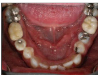
Figure 7. Mandibular occlusal view.