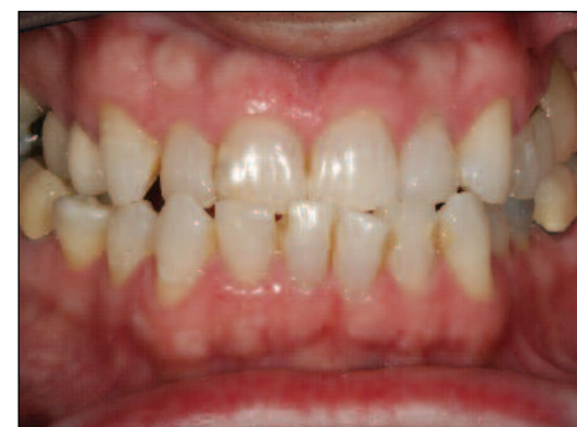
Figure 2. Retracted frontal view in occlusion.