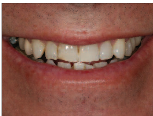
Figure 1. Smile View.

Malocclusions are common. Patients with crowded and rotated teeth, spacing, or a crossbite who are unsatisfied with their appearance may not be interested in traditional orthodontic treatment or surgical correction. Their objections can be related to the length of time needed to complete treatment, or fear of extensive surgery with extended recuperation. When deciding upon treatment, the clinician must understand how the malocclusion affects the patient aesthetically, functionally, and biologically, and the long-term impact of treatment. Many patients may not require treatment. Others may need treatment to improve functions as well as improve the long-term prognosis of the teeth and stomatognathic