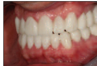
Figure 17. Provisional, left lateral view in occlusion.