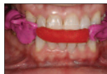
Figure 13. Bite relationship of the maxillary to mandibular posterior prepared teeth.