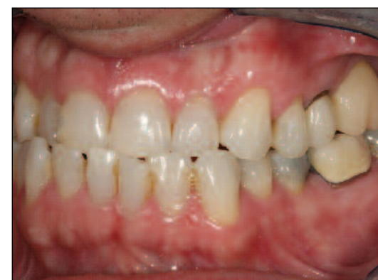
Figure 4. Retracted left lateral view in occlusion.

system. Still others may request treatment based solely on the desire to improve aesthetics. The practitioner must determine the benefits and consequences of each treatment option. It is important to speak with the patient, and determine when a noninvasive treatment plan may be optimal.