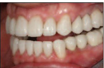
Figure 20. Final restoration, retracted left lateral view.