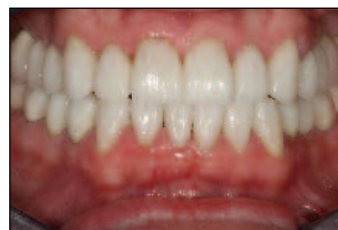
Figure 19. Final restoration, retracted view.