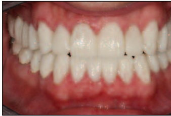
Figure 16. Provisional, frontal retracted view in occlusion.