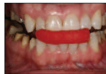
Figure 12. Preparation of the posterior teeth with the anterior teeth completely seated in the jig.