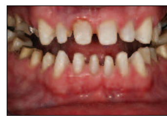
Figure 14. Maxillary and mandibular preparations.

mandibular teeth. A posterior crossbite may be a functional, stable relationship similar to a normal arch relationship, and may not require treatment. Evaluating anterior and posterior crossbites separately may reveal situations where correction of the crossbite (anterior or posterior) is not necessary to achieve the desired goal.