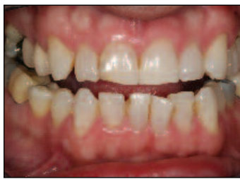
Figure 5. Pretreatment retracted view.