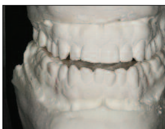
Figure 8. Pretreatment models mounted in centric relation at predetermined desired new vertical dimension.