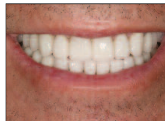
Figure 18. Final restoration, smile view.