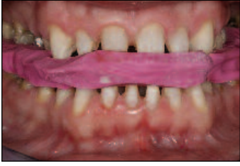
Figure 15. Posterior teeth seated into bite registration. An anterior bite registration is then created, indexing the prepared maxillary and mandibular teeth.